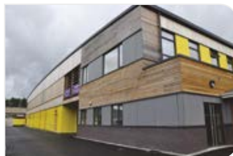
Maesydderwen High School opened in September 2012.